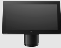
HP Engage One All-in-One System

Customize the HP Engage One Pro to suit your specific needs with its sleek yet durable design combined with powerhouse computing, and multiple deployment options.