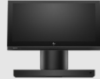
HP Engage One Essential All-in-One System

Transform your space with a versatile point of sale system that appeals to customers and supports your critical business operations. With security, durability, and flexibility built into its gorgeous design, the HP Engage One marks a new era in point of sale solutions.