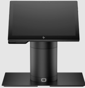
HP Engage Go 10 inch Convertible System

Adapt the sales flow to meet customer needs and deliver an exceptional experience.