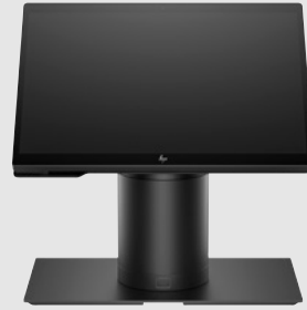
HP Engage Go 13.5 inch Convertible System

Built to deliver across today's demanding business landscape, the HP Engage Go 10 inch and 13.5 inch easily transition from fixed operations to a mobile tablet. They are durable, sized for easy readability, and can integrate essential accessories to seamlessly conduct business where and how it is needed.